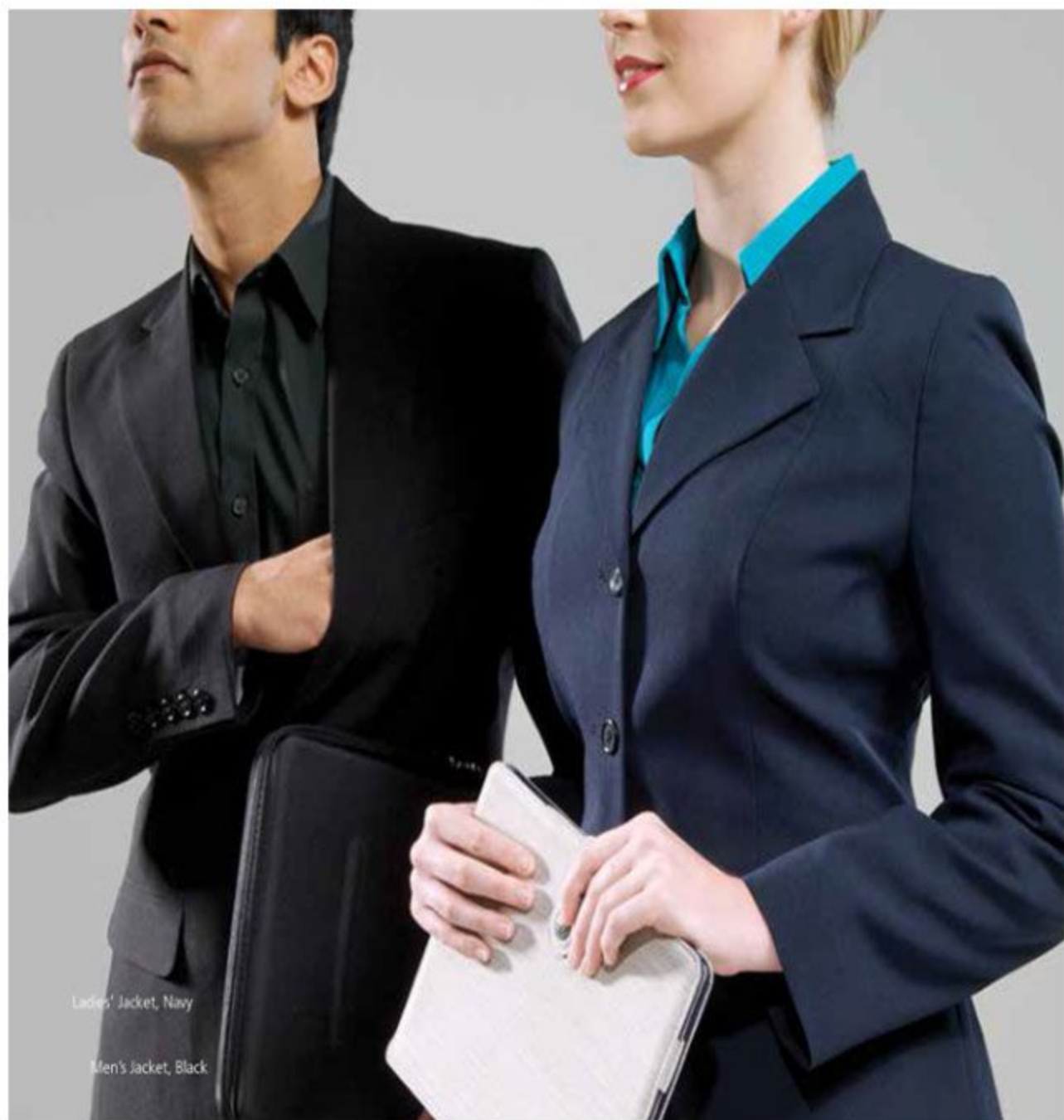
Ladies' Jacket, Navy

We match the quality of material with considered styling and impeccable manufacture. So you can be sure that our Jackets, Shirts, Trousers and Skirts will look superb day in, day out.